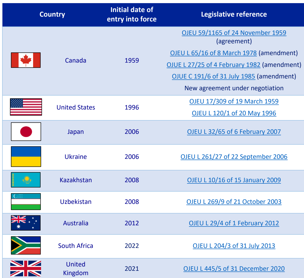
Table of Community agreements with third States on the peaceful use of nuclear materials and equipment.

OJEU: official journal of the European Union